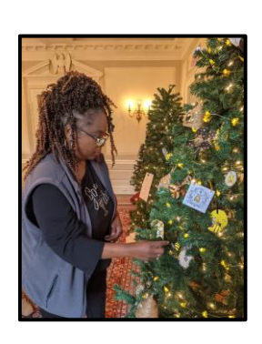
Bee Themed Tree

Clubs participate in the Delaware Hospice Festival of Trees events throughout the State. Our horticulture and garden themed trees are popular and are donated to nursing homes and day care centers. Delaware is home to a myriad of historic buildings, and many are the recipients of our clubs' expertise in