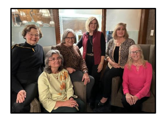
Group from New Jersey