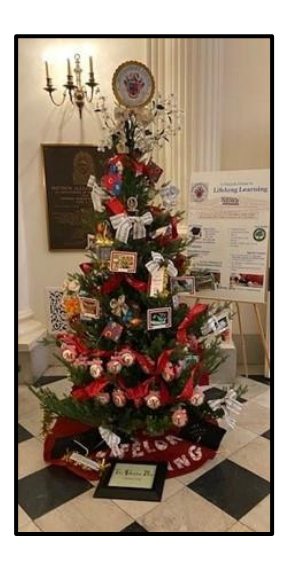
Montgomery County: "A Natural Home to Lifelong Learning" by The Garden Party Garden Club

Resources, District V was able to purchase trees at a discount allowing them to plant in three locations.